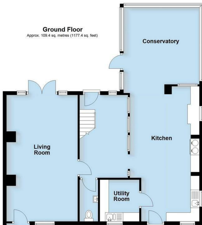
Ground Floor Approx. 109.4 sq. metres (1177.4 sq. feet)